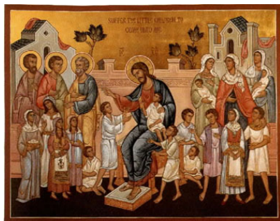
Jesus Blessing the Children

We are looking forward to a wonderful year. We have volunteers already, who are working to enhance our curriculum and provide many activities. We are looking forward to a combined effort of teachers, parents, and volunteers. We have goals set which we will accomplish through extra effort, prayer, and spiritual guidance. Our children will benefit highly not only now, but in the future as they become young adults of our parish.